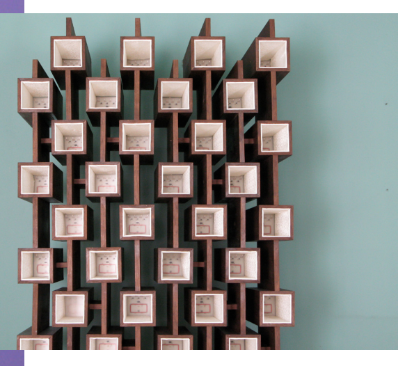
The WineM prototype uses RFID tags to connect the physical object — the wine rack — with a database, unifying the objects and their informational shadows.

are ready to drink. For example, you can say: show me all the French wine in different colors by region. Now show me the ones whose current market value, as determined by an online auction service like WineBid, is between $50-100. Since it's on the net, it can text you when your supply of your favorite wine is running low, or when there is a sale on it."